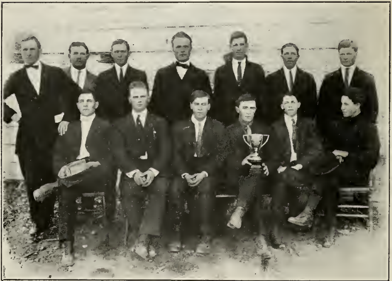
Moreland Ball Team, Blackfoot Stake M. I. A. League